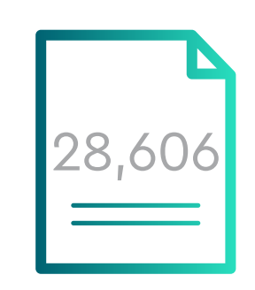
Police Intellectual Property Crime Unit (PIPCU)