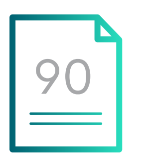
Trading Standards (TS)