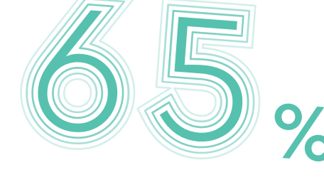
TWO THIRDS know people that have been cyber bullied